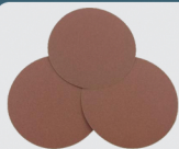
Three abrasive Discs