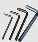
Metric Allen wrenches